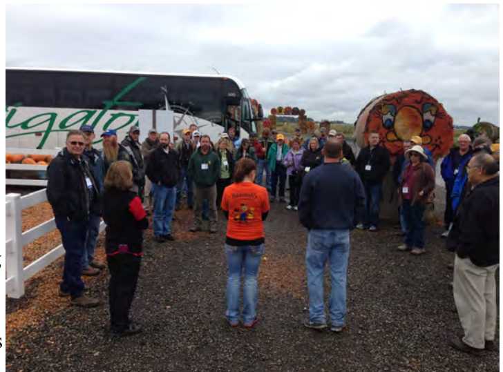
One of our excellent tour stops...Bauman Farms.