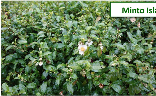
Minto Island Growers