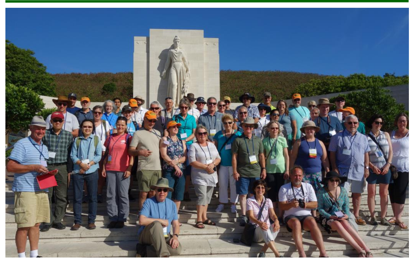
Pre-conference tour group at the National Memorial Cemetery of the Pacific in Honolulu.