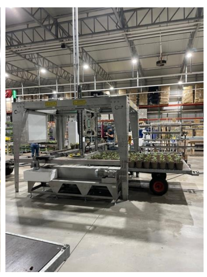
Figure 1 . (Left) Ergonomic sticking tables, (center) potting line, and (right) a Gantry robot machine <a href="https://www.sagerobot.com/gantry-robots/">https://www.sagerobot.com/gantry-robots/</a>

We use 3 sizes of trays: 72, 40 and 28. We run our trays through the tray filling machine, after filling, the media is irrigated once before sticking. Each seated team member will take one tray from the conveyor above and place it directly in front of them on their table for ease of sticking. After the tray is filled, it will be placed back on the conveyor to head to the next irrigation point before being placed on a grow rack. Once the trailer is full, the grow rack heads out to the liner area. Our trailers are pulled by battery powered tuggers ( Fig. 2 )