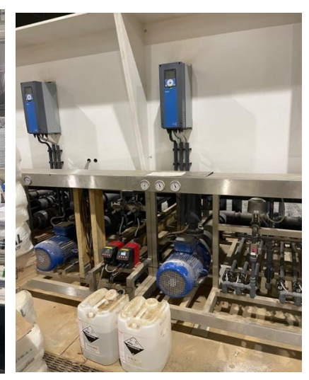
Figure 5 . (Left) Fog machine, (center) fresh water tank, and fertilizer recipe tanks for flood-floor, and (right) fertilizer injectors.

Our irrigation can be done with our mobile boom, overhead or with our flood floors. The electric powered boom is used when small areas need irrigation ( Figs. 2 and 4). This piece of equipment can also be used to apply chemicals if needed for a precise even pattern.