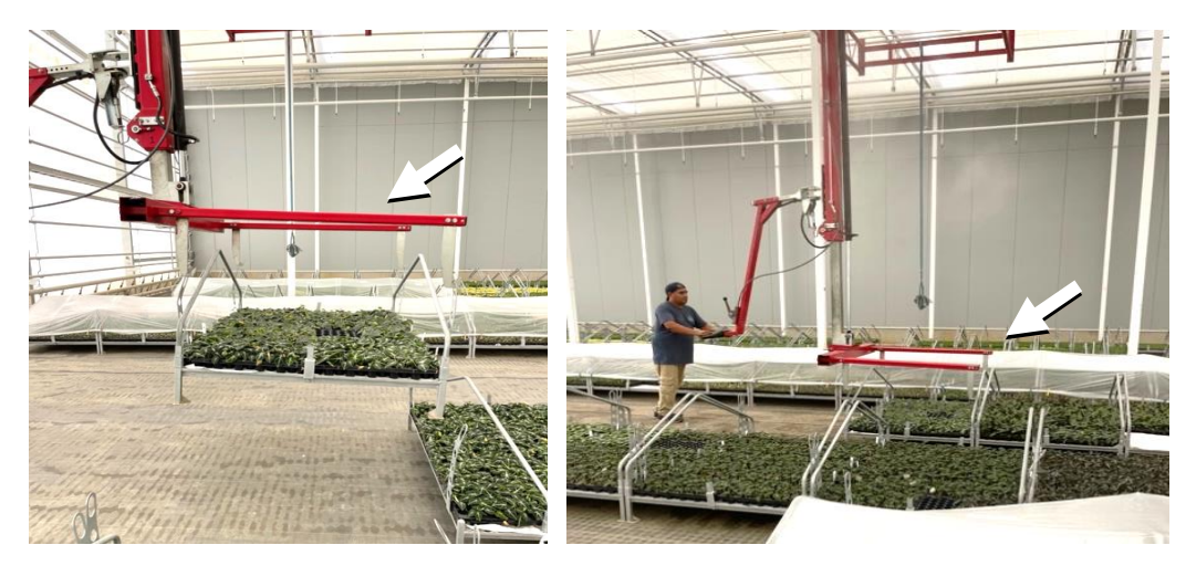
Figure 3 . (Left) Flying forks (arrows) moving grow racks. (Right) Operator controlling grow racks.

This same equipment will be used to pick up grow racks of fully rooted plants for planting into 12-cm or 17-cm recycled plastic pots. We load our trailers with finished liners and head to the potting line (Fig. 1). Our machine has a pot dispenser that releases the pots onto the conveyor, fills the pot with media and dibbles a hole. Once planted the pot will go through a series of irrigation nozzles to lightly water the plant for its trip to the greenhouse. The potted plants are then gathered on the rail for the robot to place onto the trailer (Fig. 1). When a line on the trailer is full the trailer moves forward the required space for the next row of plants. When two trailers are full of