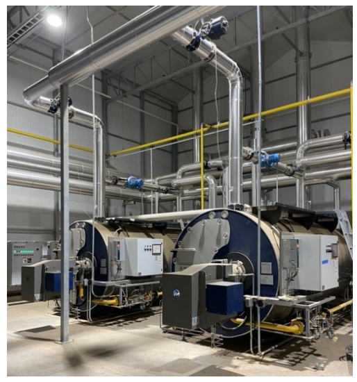
Figure 7. (Left) Hot water holding tank, and (right) boilers for heating the facility.

Our entire greenhouse environment is controlled by IIVO Hoogendoorn <a href="https://readysetgrow.nl/">https://readysetgrow.nl/</a>. Just a few of the benefits of IIVO are ease of use, weather forecasting that will close vents in case of a storm, and my favorite - it can be controlled remotely with your phone. Our growers are able to access real time information from the greenhouse environment. We are also able to look at a year's worth of data, in an easy-to-read graph.