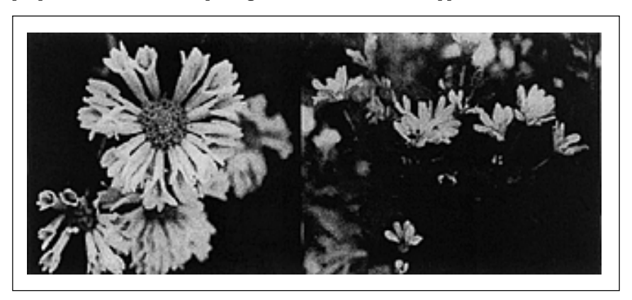
Figure 1. Flower shapes of mums 'Crazy Cat', No.1, (left) and 'Pink Cat', No.15, (right).

Our mum 'Pink Cat' has small single flowers of pale purple color. The mum 'Crazy Cat' has small single flowers of white color. The floret of 'Crazy Cat' is a long tube with a purple mouth of star like opening. Results show that a 2.5 ppm drench treatment is