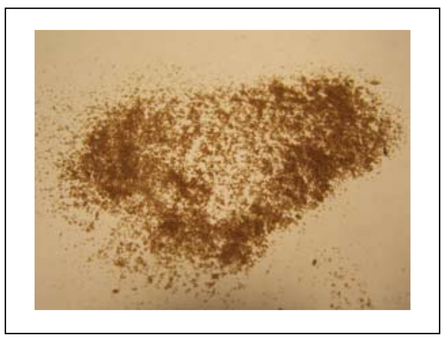
{\bf Figure~2.~} Spiranthes~odorata~`{\bf Chadds~Ford'~seed~no~magnification.}