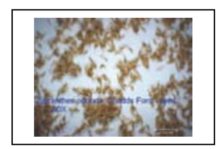
\label{eq:Figure 3.} \textbf{Figure 3.} \ \textit{Spiranthes odorata} \ \text{`Chadds Ford'} \\ \text{seed 40X.}