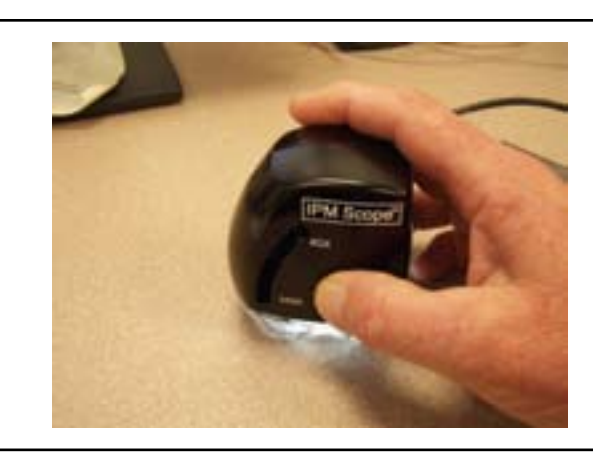
Figure 1. Spectrum Technologies 40X digital microscope.