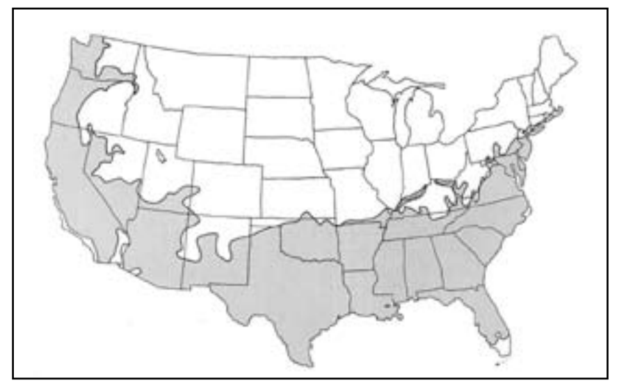
Figure 1. Potential planting range for loblolly pine trees in the United States (Gilman, 1994).

fertilizer, one could conceivably produce a substrate for under $15 per yd<sup>3</sup> compared to $40 plus for traditional P substrates and $15 plus for aged PB. Since WoodGro<sup>TM</sup> is ground to the correct particle size to provide the desired aeration and water holding capacity, there is no cost associated with adding aggregates such as perlite and vermiculate as required for P substrates.