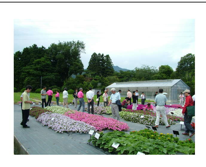
Figure 1. Exhibition of new selections of flower species in the Plant Breeding and Experiment Station of Takii Seed Company.

The first visit was the 70-hectare Plant Breeding and Experiment Station of Takii Seed Company <a href="http://www.takii.co.jp/english/">http://www.takii.co.jp/english/</a> located southeast of Konan City. This station has been devoted to breeding new selections of both vegetables and ornamentals and their propagation since 1968 (Fig. 1).