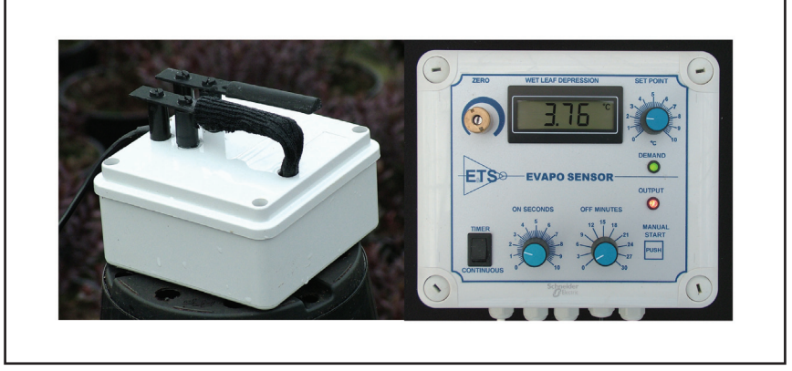
Figure 1. The Evaposensor (left) and the Evaposensor Control Interface (right).

Pulborough, W. Sussex; Binsted Nursery, Arundel, W. Sussex and Lowaters Nursery, Warsash, Hampshire. Further Evapomist testing and demonstrations took place in summer and autumn 2009 at Boningale Nurseries, Wolverhampton, W. Midlands; Living Landscapes Nursery, Chester, Cheshire and Micropropagation Services, Loughborough, E. Midlands. Nurseries used mist nozzles on either low risers from the propagation beds or on overhead lines. Most inserted cuttings into cell trays stood on drained capillary sand bases to help pull any surplus water from the rooting medium, but one nursery laid trays on capillary matting over polythene on a concrete glasshouse floor and another on benches covered with capillary matting with a 100 mm overhang to improve drainage. Summer shading was used as necessary with whitewashed glass and / or shade screens.