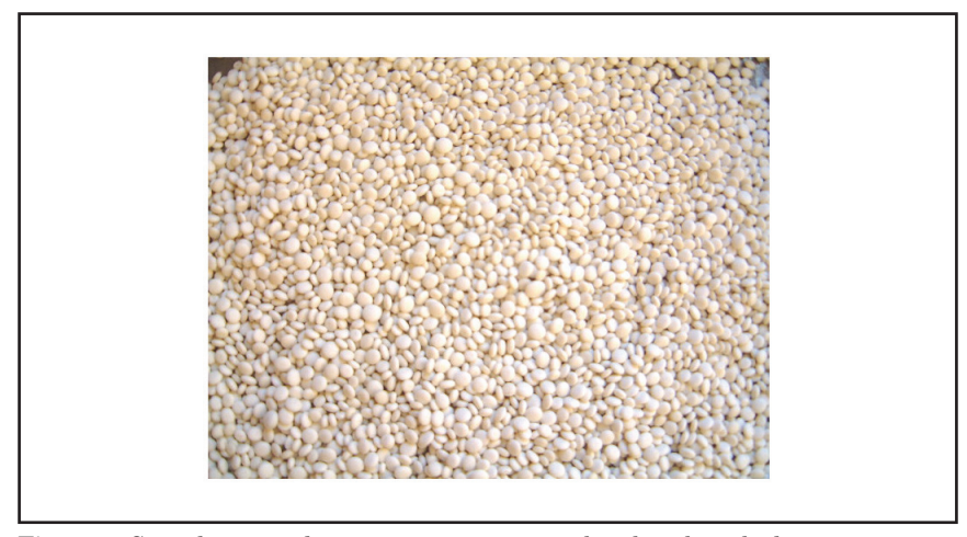
Figure 2. Crystaline granular magnesium ammonia phosphate hexa-hydrate.

The research we've conducted for the last 3 years with this product concluded that this technology has produced a viable slow-release fertilizer. Extensive laboratory