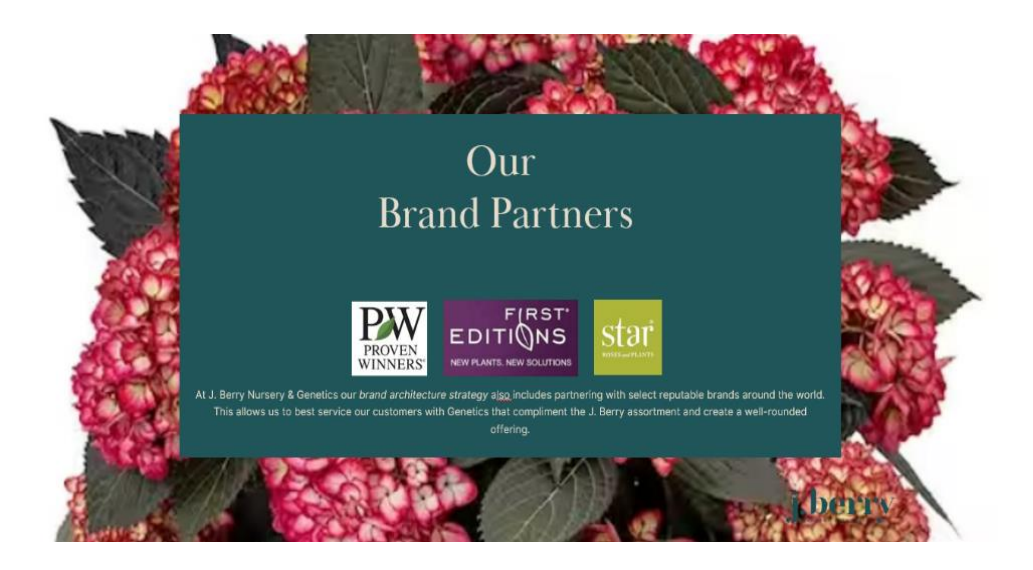
Figure 5. Brand partners of J. Berry Nursery.