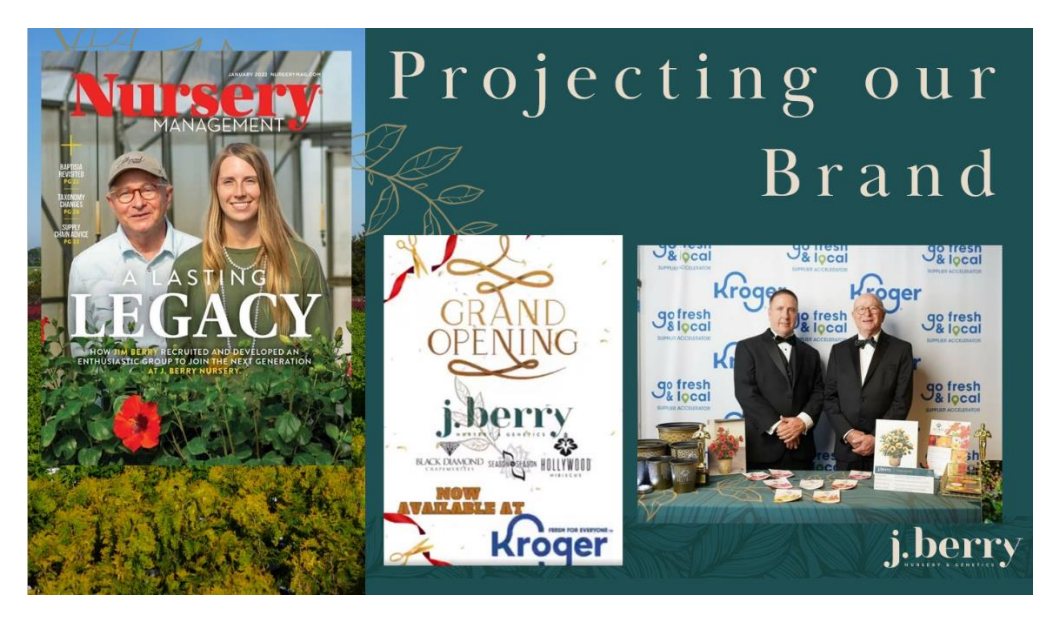
Figure 1. Projecting the J. Berry Nursery brand.

At the very heart of J Berry Nursery's achievements lie its mission and values. The company's mission, deeply rooted in delivering excellence, is complemented by values such as integrity, leadership, resilience, and innovation ( Fig. 2 ). These values form the core of every operation and interaction. Behind every successful sales strategy is a dedicated team of sales managers. At J Berry Nursery, sales managers play a pivotal role in bridging the gap between the company and its cherished customers. Their