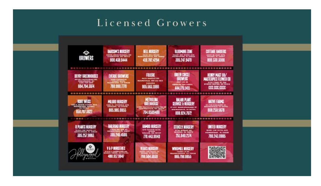
Figure 4. Licensed growers for J. Berry Nursery.

International, Proven Winners, First Editions, Endless Summer, and Star Roses and Plants. ( Figs. 4 and 5 ).