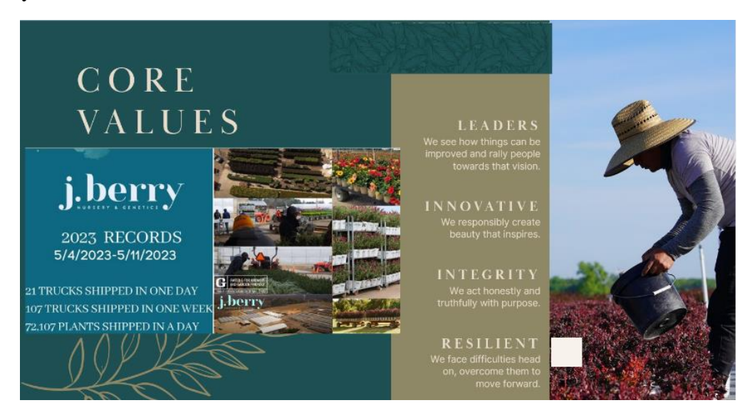
Figure 2. Core values of J. Berry Nursery: leaders, innovative, integrity, and resilient.

insights, guidance, and dedication ensure that J Berry Nursery consistently meets customer expectations. J Berry Nursery's approach to potential customers goes beyond traditional sales tactics. The company seeks to understand each customer's unique needs, aspirations, and preferences. This personalized approach lays the foundation for trust and sets the stage for customers to a satisfying partnership for their individual business goals.