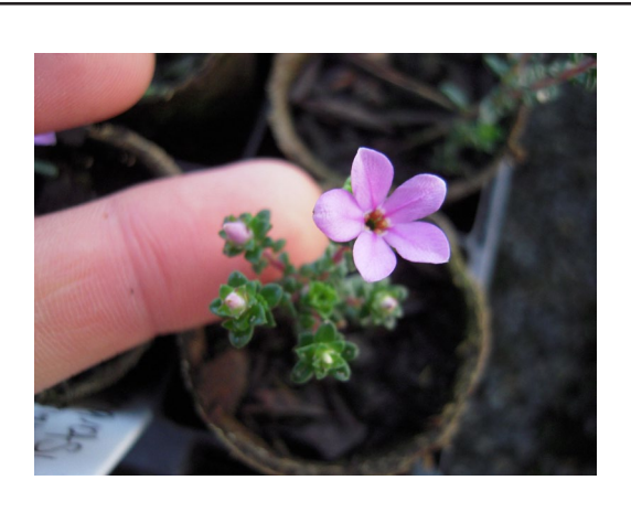
Figure 2. 'Starblush' at a garden store (May 26).