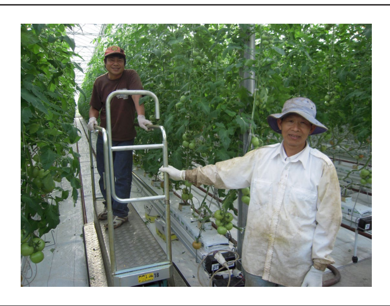
Figure 1. Visiting a tomato greenhouse at HOPS Ltd. (May 26).

The IPPS conference was held in Blenheim. From 27 to 30 May there was a workshop in the morning and a nursery tour in the afternoon. The workshop was a valuable experience for me because I first studied at a workshop abroad. I was particularly interested in many presentations on the plants native to New Zealand (NZ), which were very different in species diversity and growth environment from those in Japan. The tour was also rewarding because I had a chance to visit a range of agricultural and cultural places such as nurseries, greenhouses, agribusinesses, commercial facilities, and museums. The large tomato production company which I visited was larger in scale than I had expected (Fig. 1). I also visited garden centers that dealt with small rare flowers like Acmadenia tetragona 'Star Blush' (Fig. 2), Nelson Nursery, which gave us a grubbing presentation (Fig. 3), and Yealanad Winery, which arranged a tasting event (Fig. 4).