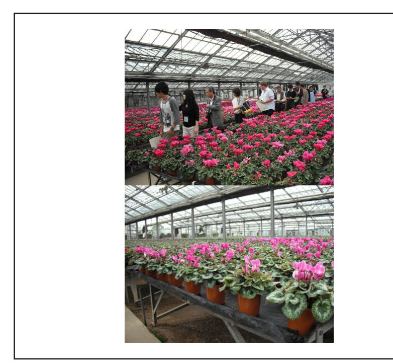
Figure 1. Hayakawa Engei Co.Ltd. Cyclamen grew vigorously in greenhouse.

Next we visited Kaneya Co., Ltd., a famous supplier of plastic growing pots, especially the "slit pot" (Fig. 2). The slit pot inhibits root circling during long term