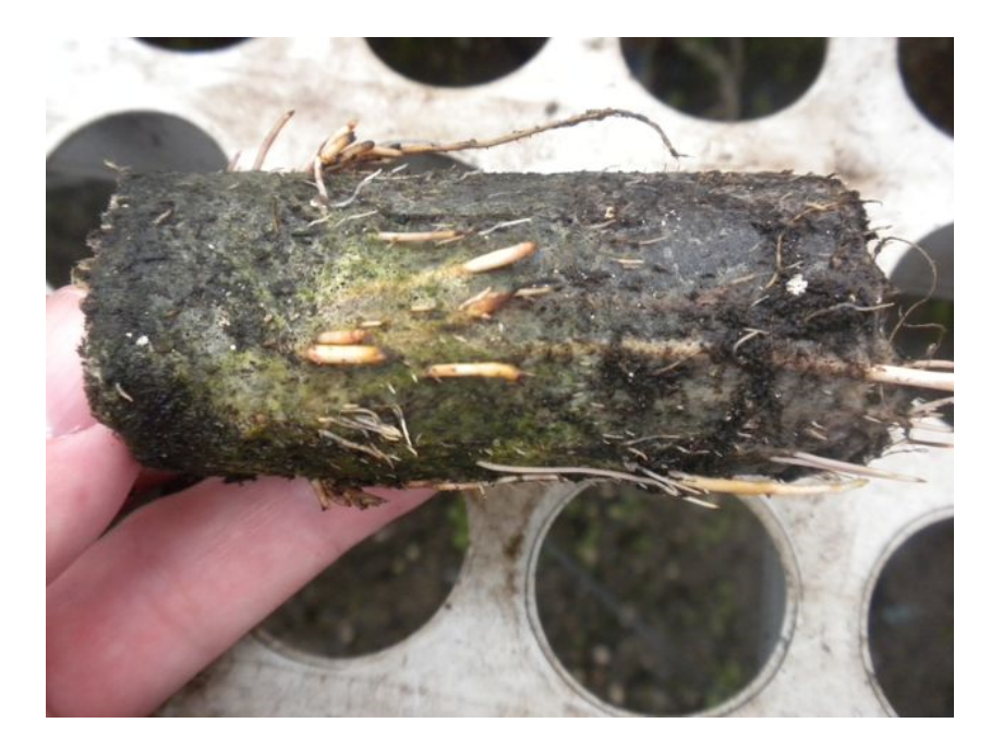
Fig. 3. A well-air-pruned Eucalyptus plant in a 35-mm Ellepot.

The question that has baffled me, therefore, is why are root manipulation containers such as air pruning containers probably used today by less than 1% of growers? If an air-pruning container was going to produce a much better root system people would want to use it, but this has not been the case to date for most nurseries.