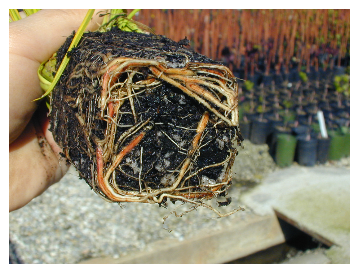
Fig. 1. Typical problem of circling roots in a container.

In my opinion there are many root-related problems in standard containers that hold back plant performance. Problems like circling roots are some of the worst type of bad roots created in containers (Fig. 1).