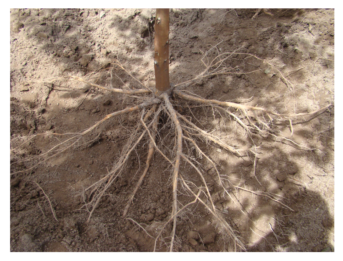
Fig. 2. Fantastic roots are possible with a container plant.

There have been many options to regular containers developed over the years with things such as copper treatment of containers, root trapping material on the inner wall of containers, and air pruning of the root system in containers. It would seem that air pruning is becoming the most popular method of doing this which is logical since there are no chemicals involved and it is a very natural process which allows for the reduction or elimination of bad quality roots, the increase in the total number of roots, and also the possibility of a better micro-climate in the pot.