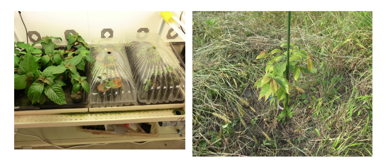
Fig. 3. Habituation.

Abbreviation: BAP = 6-benzylaminopuring.