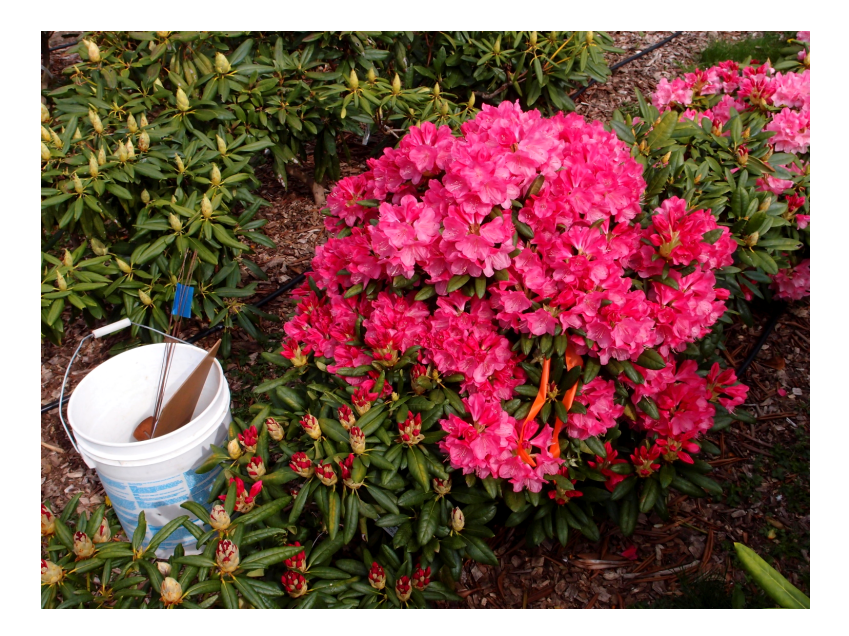
Fig. 4. An example of an F<sub>1</sub> selection with superior floral and vegetative attributes.