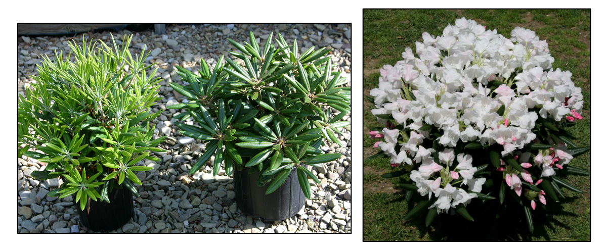
Fig. 1. Vegetative (left) and floral (right) characteristics of Rhododendron hyperythrum.

Although it is native to Taiwan, R. hyperythrum occurs at high enough elevations [1000-2000 m (3281-6562 ft)] to be considered a hardiness Zone 6 species (Cox, 1990). At Holden Arboretum's David G Leach Research Station in Madison, Ohio (Zone 5b), R. hyperythrum grows well in the field but exhibits some flower bud damage at winter temperatures below -13°C (8°F). In addition to root rot resistance, this species possesses a number of desirable ornamental attributes — thick, deep green glossy foliage, a mounded, dense growth habit, and a floriferous nature. It frequently covers its foliage with blooms, more like an evergreen azalea than a typical rhododendron (Fig. 1).