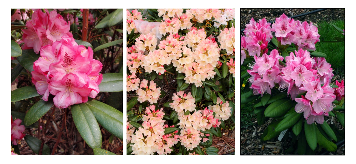
Fig. 3. Floral attributes of F<sub>1</sub> selections from Rhododendron hyperythrum breeding populations.

Some very high quality plants have been obtained among the variable F_1 progeny. Selection at the Madison, Ohio, site is made for plants that have good vigor and foliage quality in the open field, winter hardiness (U.S.D.A. hardiness Zone 5b), and well-shaped inflorescences with good flower color. Flower color and patterning in F_1 s from white × red, white × yellow, or white × purple crosses is variable, often ranging from white, to intermediate colors, to occasional saturated colors. Examples of superior flowers from these populations are shown in Figure 3. Characteristics of an exceptional hybrid include a dense mounded habit, dark green glossy foliage, and saturated red flower color that are most desirable in a commercial plant (Fig. 4).