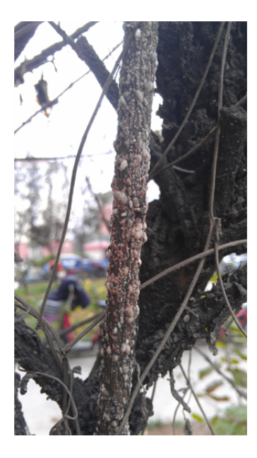
Figure 3. Infestation of crapemyrtle bark scale can be confirmed by the "pink blood" when crushed.