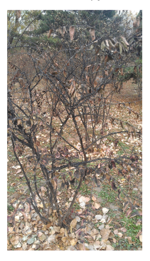
Figure 5. Black sooty mold caused by crapemyrtle bark scale infestation was covering all parts of the crapemyrtle.

Adult female CMBS do not have wings, so long distance spread is thought to be due to the transportation of infested plants. Short distance spread could be due to wind, rain, birds, squirrels or ants. Ants have been observed on many trees when CMBS is present (Figure 6). For some scales, ants play a role in moving scales to fresh locations within a plant or to new plants.