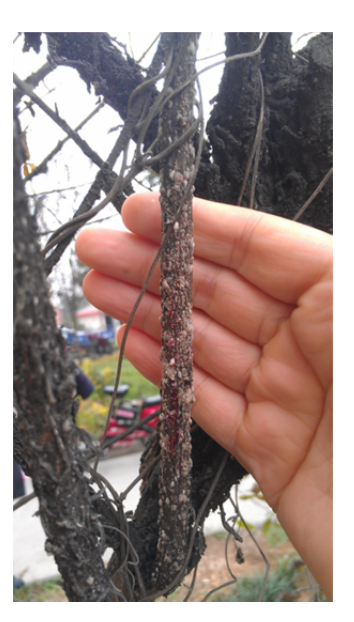
Figure 2. Different stages of crapemyrtle bark scale found on this twig.

Infested crapemyrtle trees often harbor overlapping generations of scale insects, including all life stages from eggs to adults (Figure 2). A good confirmation of CMBS presence is the "pink blood" (Figure 3) that oozes from the scale when crushed. Adult female scales look superficially similar to mealybugs, being white and fuzzy. Mature females are 2-3 mm long and can be found from the youngest shoot tips to the base of trunks (Figure 4), and frequently under peeling bark, a common trait of many crapemyrtle trees. The adult male scale has wings and may not be present. Scales produce honeydew which leads to growth of black sooty mold on the bark. Under severe infestations whole plants can be covered by black sooty mold, reducing the appearance quality of the plants (Figure 5). Overall impacts on plant health by CMBS have not been measured, but it appears that flower size and number are reduced with heavy infestations. Plants may leaf out later in the spring, and dieback of branches and entire plants has been observed on occasion.