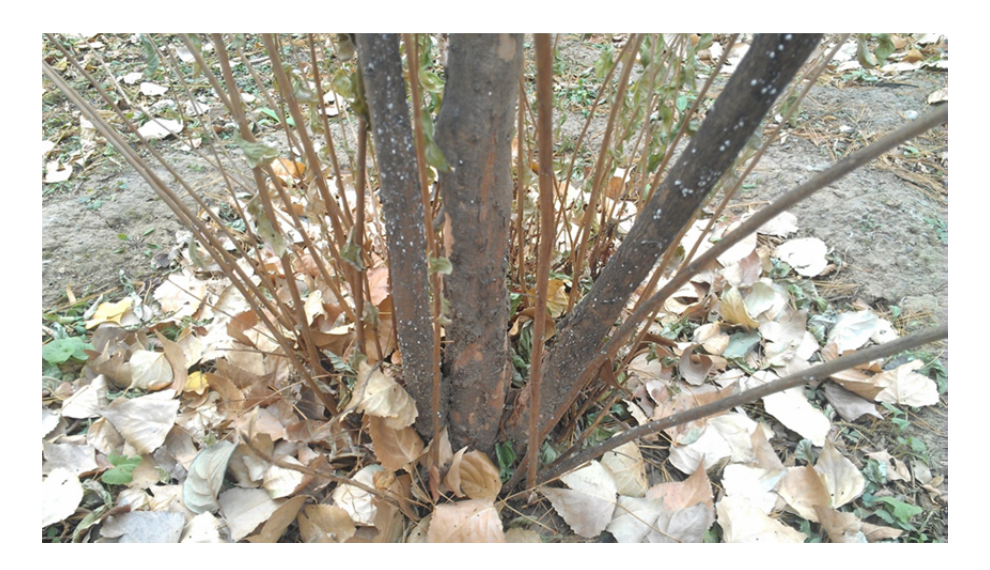
Figure 4. Crapemyrtle bark scale could be found any part of the trunk of a crapemyrtle.