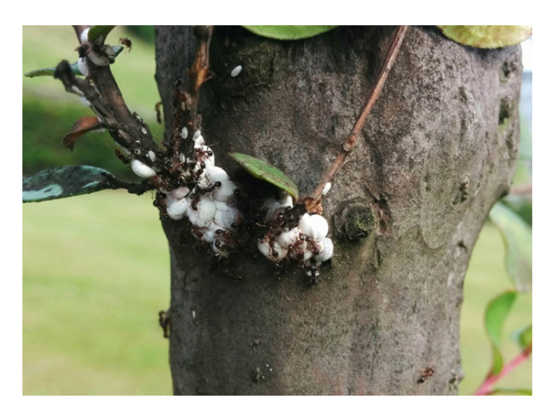
Figure 6. Ants are often found at crapemyrtle infestation sites.

Crapemyrtle plants should normally be planted in full sun conditions. Observations suggest that levels of CMBS infestation may be correlated to shade levels, if other conditions were similar. This may provide additional support to the full-sun-planting recommendation for crapemyrtle plants.