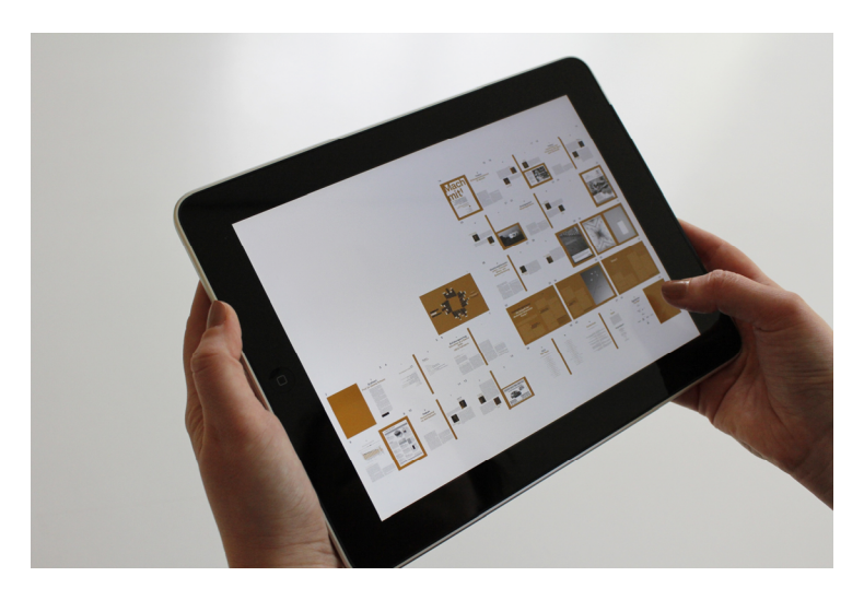
Figure 11. Apple IPad tablets are used extensively at Mortellaro's Nursery.

IPad tablets are used extensively at Mortellaro's Nursery (Figure 11). We supply tablets to all managers, supervisors, drivers, and chemical applicators. We purchase used IPad Air Tablets from Apple and protect them with a lifeproof case. This is a cost of only about $450 per IPad. The cost is minimal with the benefits gained. The IPads are used for group texting, tracking drivers' locations and hours, multiple inspections and reports, email, shared calendars for each department, reference for customers, plant info, and chemical applications.