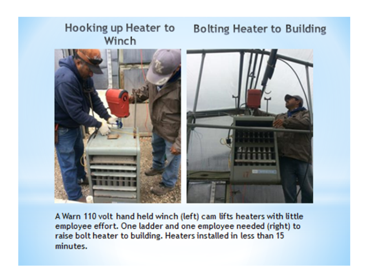
Figure 8. A Warn winch can lift heaters with little employee effort.

their mounting points in the greenhouses (Figure 8). We also created custom muffler clamp brackets for each heater. Each heater can be mounted using just a 1\ cm\ (0.5\ in.) wrench and four nuts. It currently takes one man on a ladder and one man on the ground about 15\ min to raise and mount each heater.