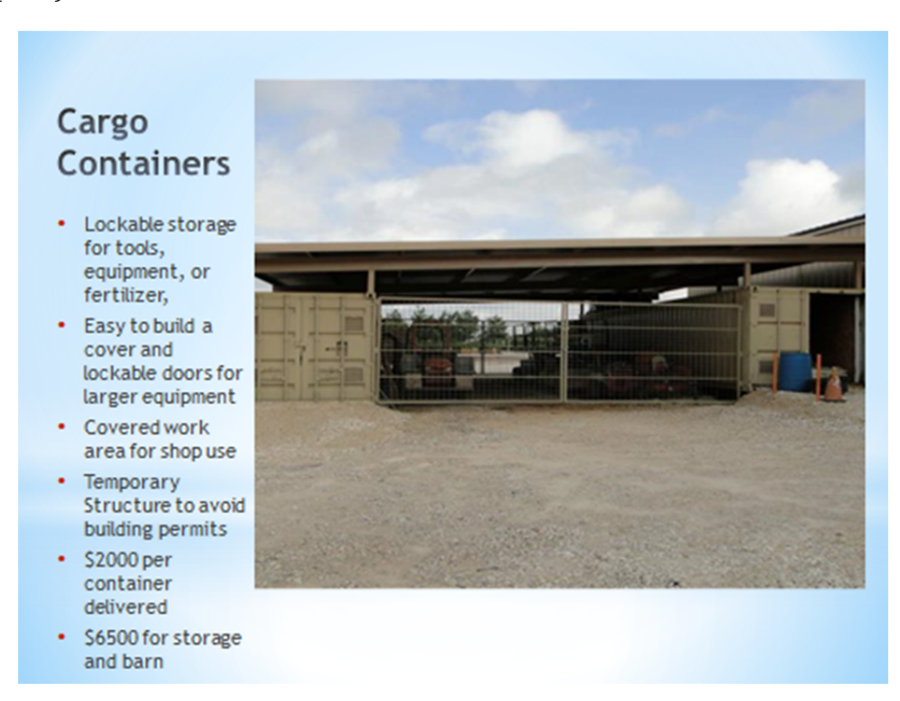
Figure 12. Cargo containers can be utilized as inexpensive building options for shop use, storage and secure office space.

Cargo containers are excellent as an inexpensive building option for shop use, storage and secure office space (Figure 12). Two cargo containers can be placed with a roof between them to provide covered and even lockable storage inside and outside the containers for equipment repair and storage, fertilizer or chemical storage, or a field or sales office. Better still: using cargo containers allows the construction of an office or storage area that is classified as temporary structure and avoids the need for building permits and increased taxes for structures. Currently cargo containers can be purchased for about $2500 each for a 12 m (40 ft) unit with double doors.