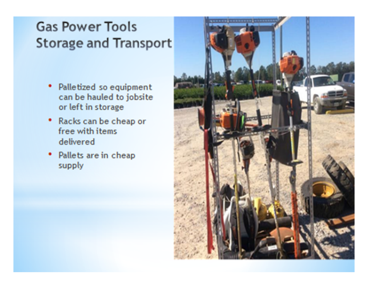
Figure 4. Gas powered tools are stored and transported with racks attached to pallets.

Small, 2-cycle gas engines are used extensively in our nursery. We find it easier to store these machines in our shop on a pallet and set it outside daily for crews to sign-out and sign-in, as needed (Figure 4). This method reduces traffic flow in our shop area and avoids disturbing our mechanic. Storing of handheld power tools was also an issue until we created two different methods of storing them along with batteries. We utilize locked cabinets for tools used by field employees and unlocked storage for maintenance and mechanics in our shop (Figure 5).