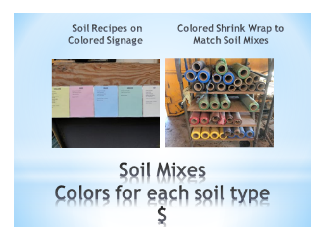
Figure 3. Colored signage for soil mixtures, including color-coded shrink wrap of media on pre-filled pallets.