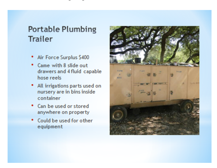
Figure 9. A portable plumbing trailer converted from a US Air Force surplus jet support trailer.

We purchased a used US Air Force jet support trailer many years ago. We stripped the trailer of its hose reels and stocked it with all of our plumbing supplies including a water pump, a generator, and a compressor (Figure 9). We haul the trailer to plumbing or construction projects on our property. This allows us to have the supplies needed at the worksite—rather than inefficiently running back and forth for supplies. A used utility truck body could be utilized for the same purpose.