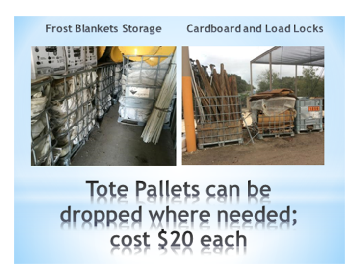
Figure 6. The $20 tote pallets can be placed where needed.

and keep it in usable condition (Figure 6).