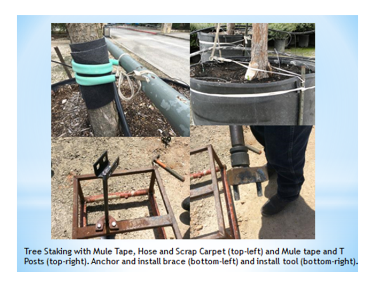
Figure 7. Tree staking with mule tape, hose, scrap carpet and mobile home anchors.

There are many methods for anchoring trees. We utilize three techniques to anchor trees at our operation. Our most recent method utilizes mobile home anchors and mule tape to secure large containers from blowing over (Figure 7). We anchor the pot to the ground rather than anchoring the trunk. We created a steel frame to hold the anchors in place so that one person can install the anchors.