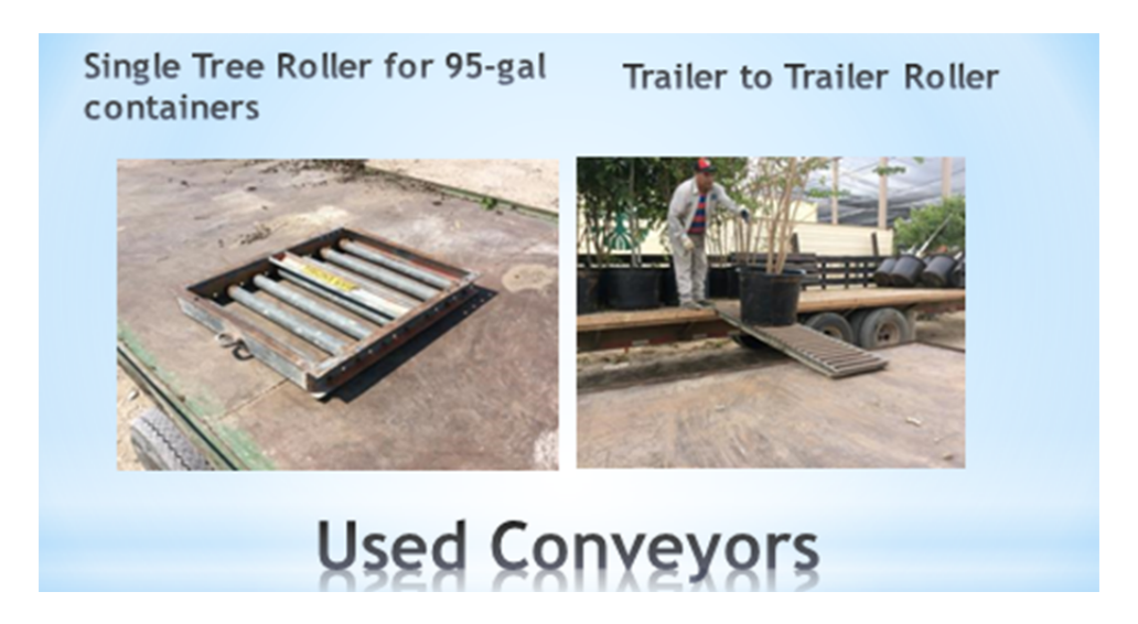
Figure 10. Used, portable conveyors for moving large containers.

containers from and onto trailers. The conveyors not only reduce potential employee injuries, but also eliminate the need for equipment for larger trees and shrubs.