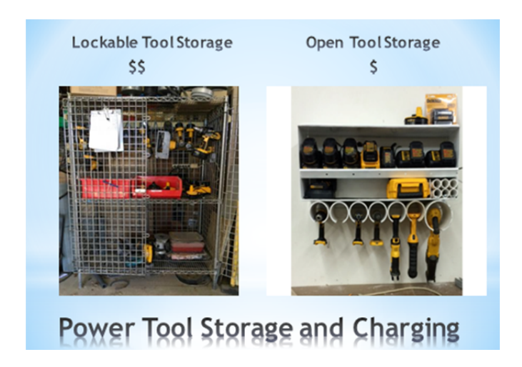
Figure 5. Lockable and open tool storage and charging area.