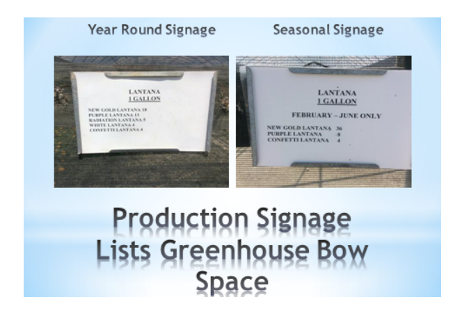
Figure 2. Production signage lists for greenhouse bow space usage.

Mortellaro's Nursery, Ltd. uses signs for hormone rates, standard and seasonal production numbers, soil mixes, pictures of insects and disease, and scheduled chemical treatments. At our nursery, we post signs on blocks and greenhouses that list quantities of each crop in the block or greenhouse (Figure 2). The signs list year-round and seasonal quantities needed. This allows production crews to do quick visuals of what crops need to be potted—and allows managers to prioritize crop varieties rather than worry about needed production numbers on a daily basis. The same signage is used on propagation tables so that the propagation department fills a production need as soon as it appears. Colored signs are used for different propagation soil mixes and those colors are also used for the colored saran that is wrapped around pre-filled pallets (Figure 3). The color system solves any language or literacy problems with our crews.