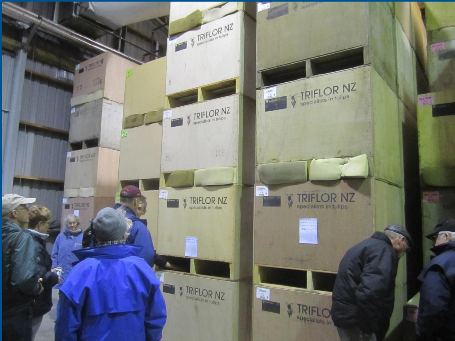
Warm air bulb dryers