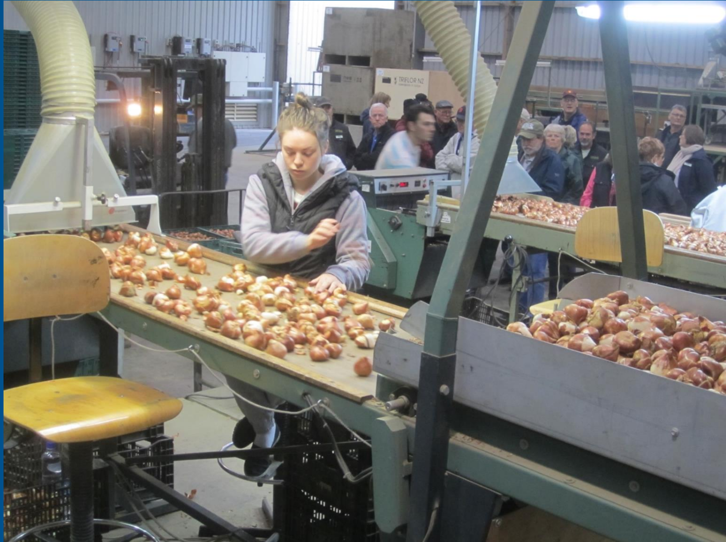
Triflor: The bins of tulip bulbs keep coming for sorting