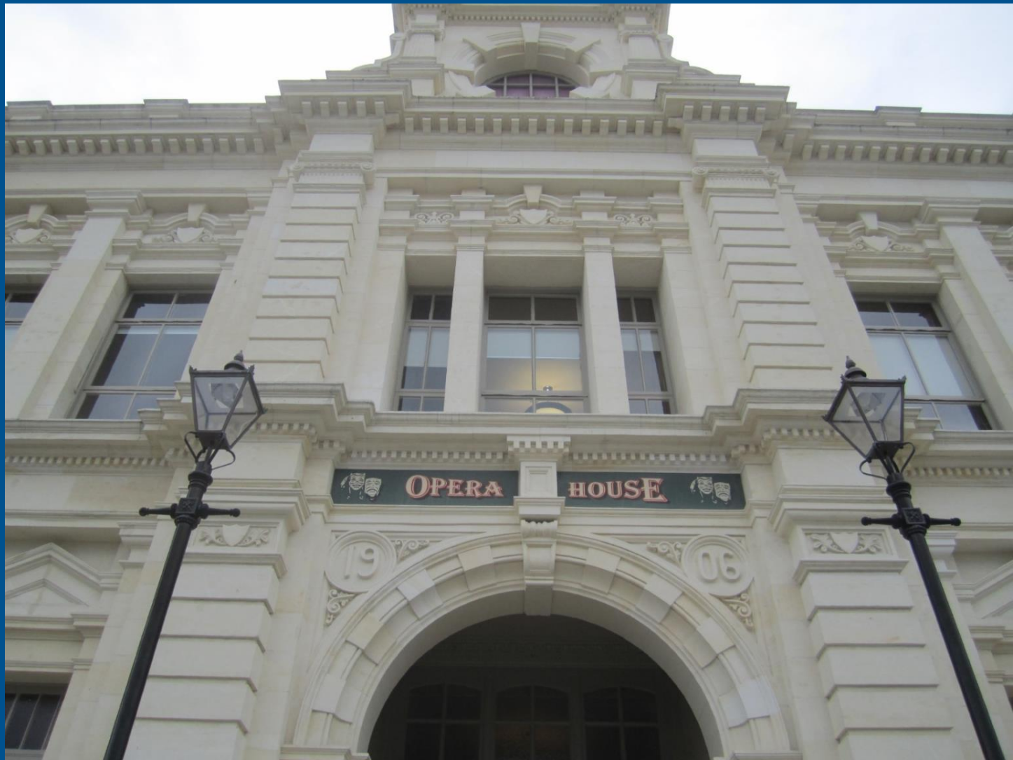
Oamaru Opera House