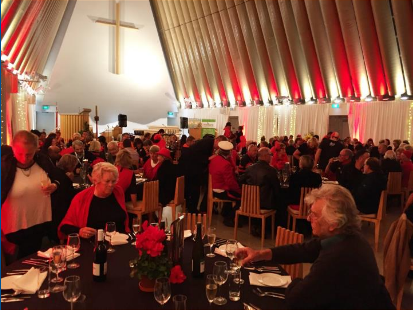
Party in the church