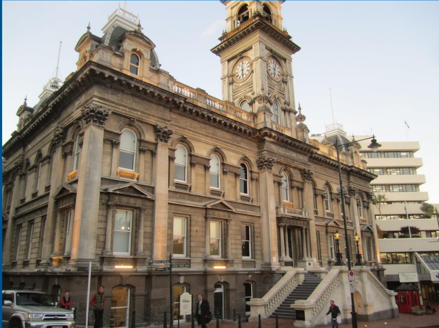
Old City Hall. Look at how magnificent it is.