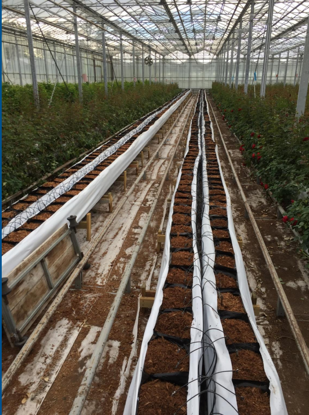
Interesting drip setup