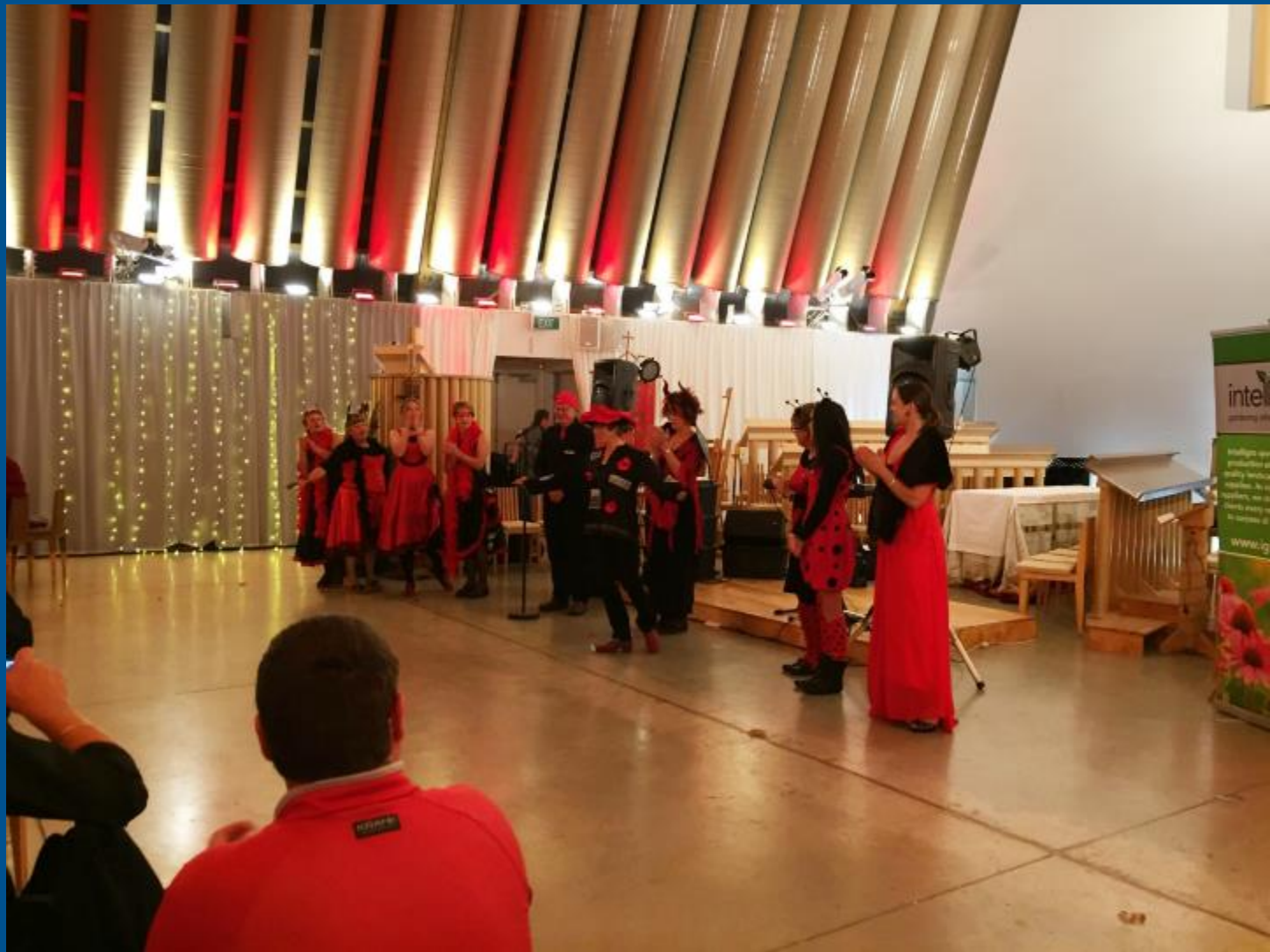
Best dressed contest