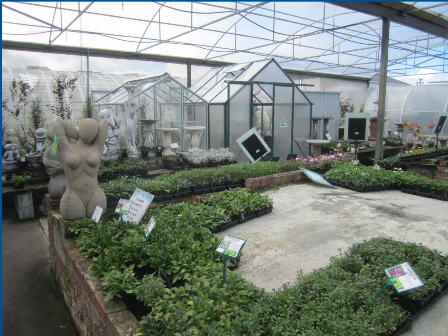
Diack's: Concrete benches and glasshouse