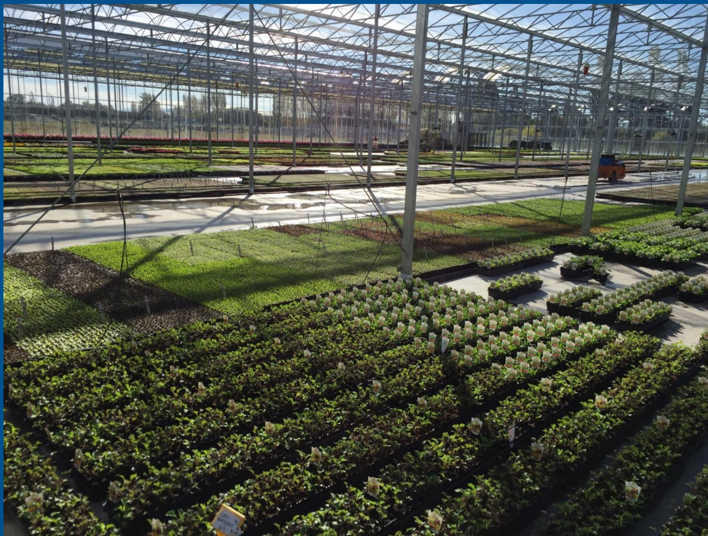
Again, nice and clean with concrete flood irrigation