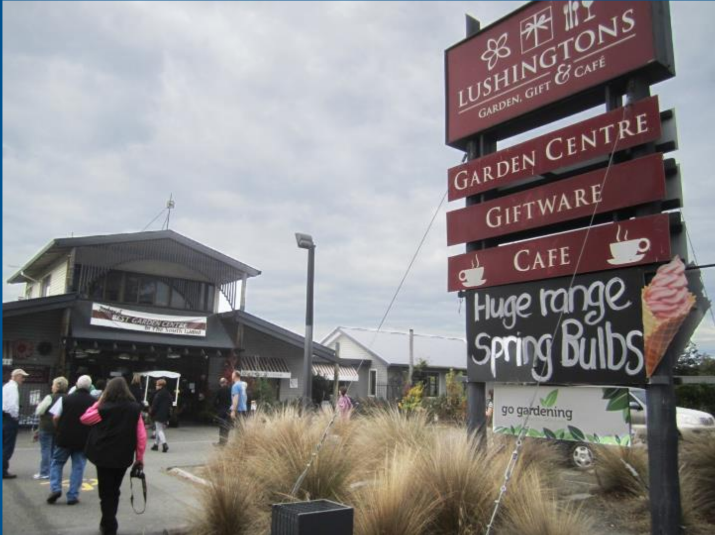
Lushington's Garden Centre