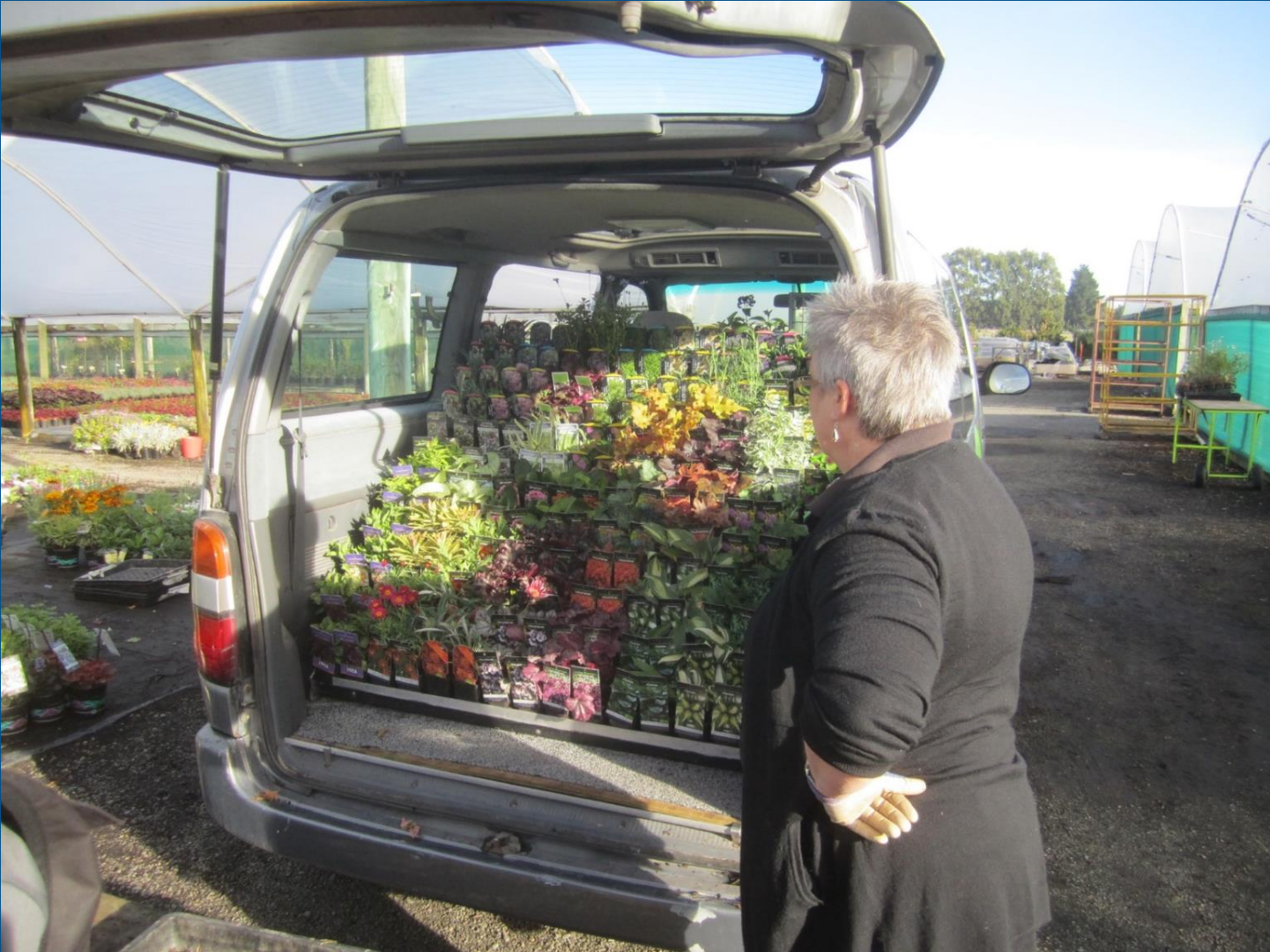
The sales van