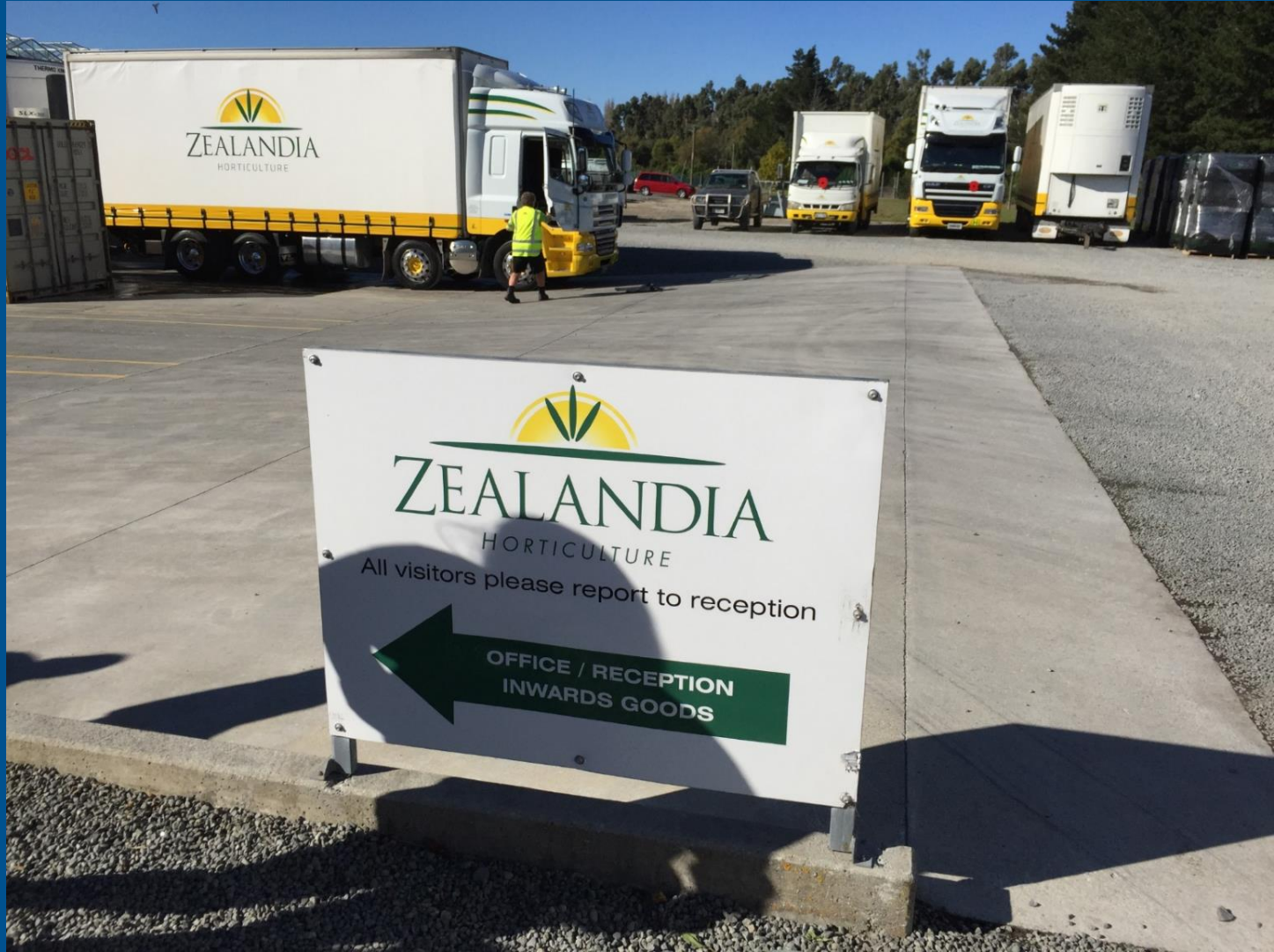
Zealandia: A very large grower