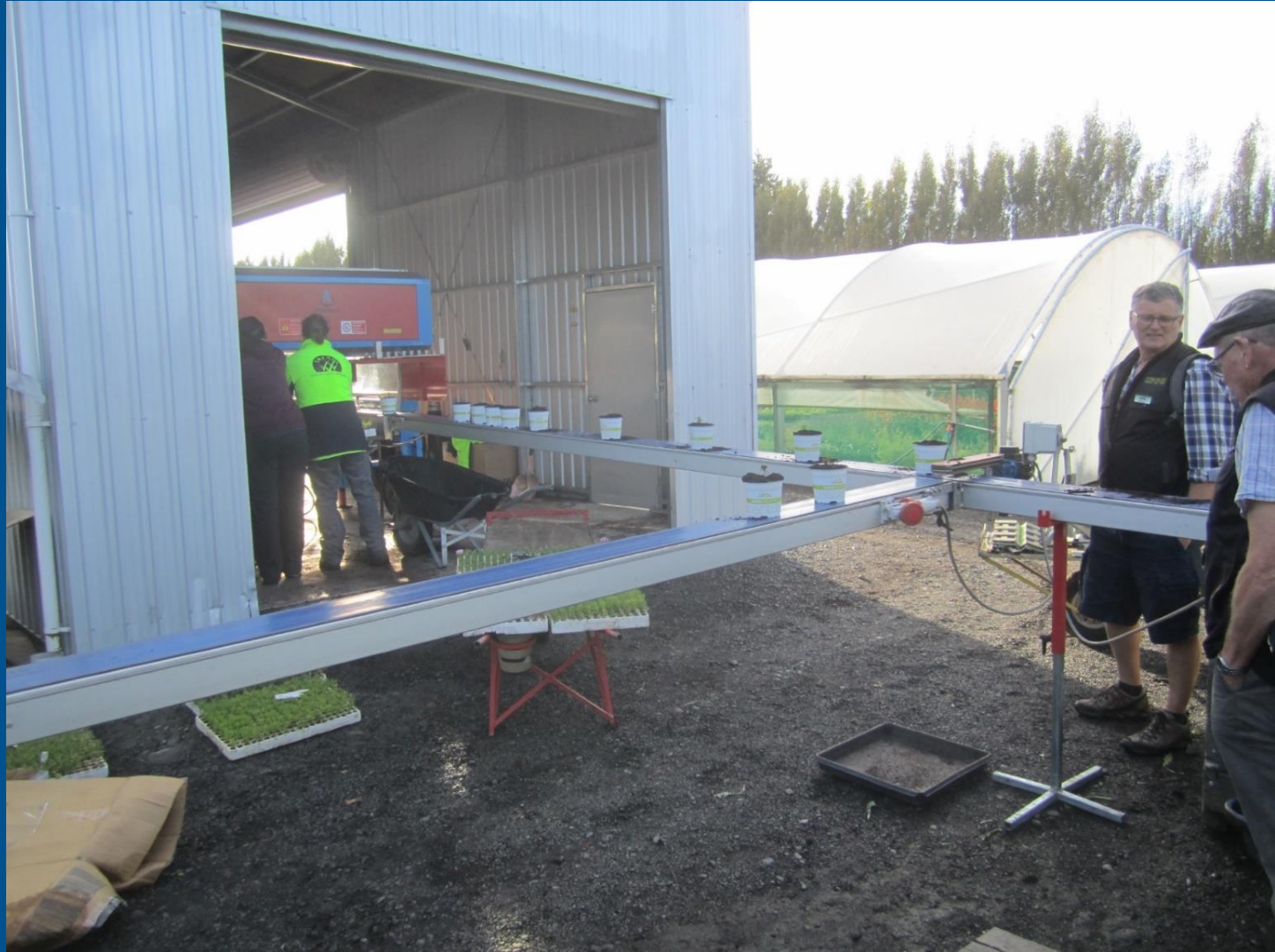
Conveyor - direct from planting to placement