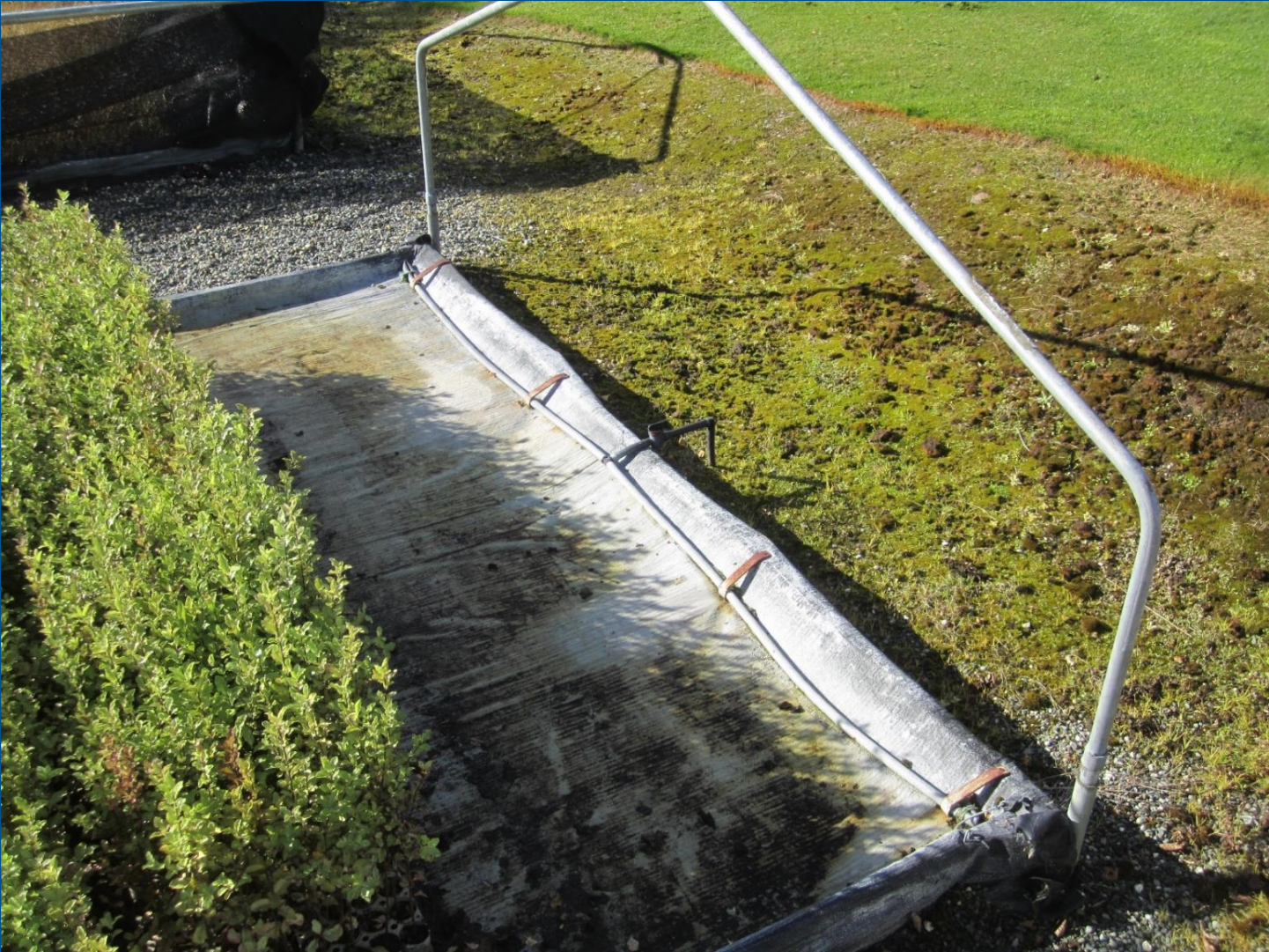
Interesting flood irrigation system