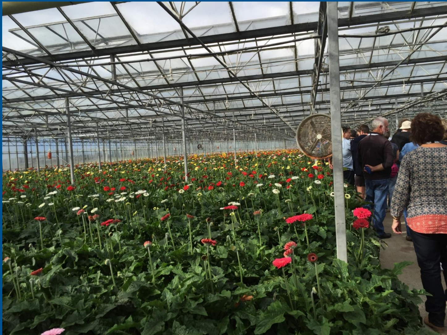
A cut flower grower