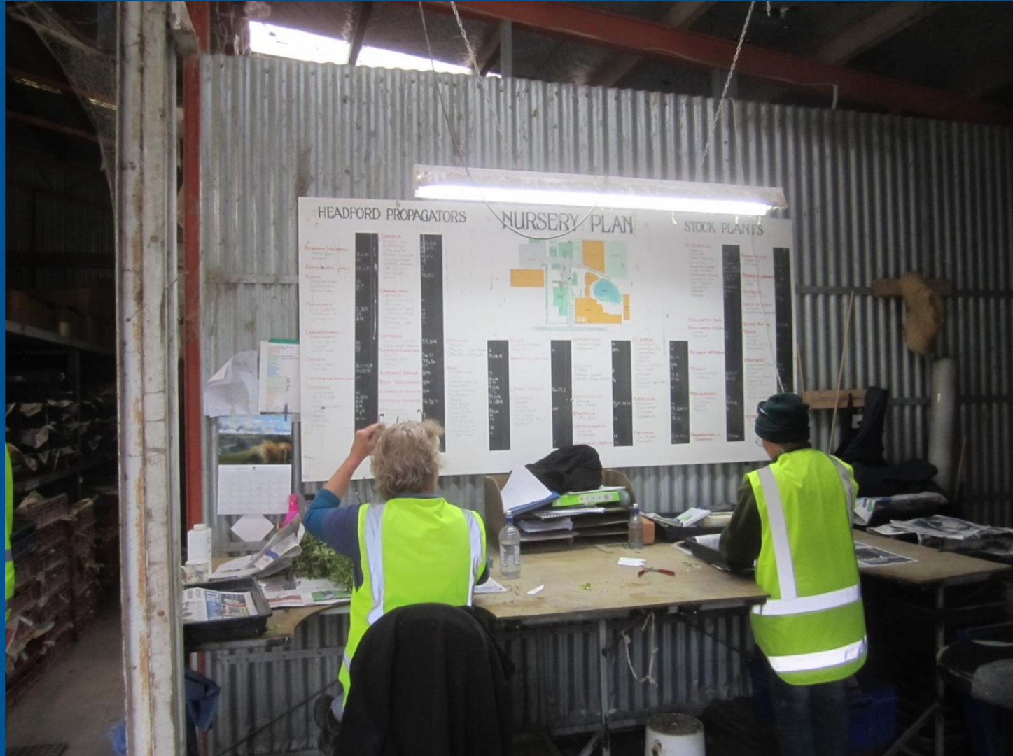
Great chalkboard map of plants