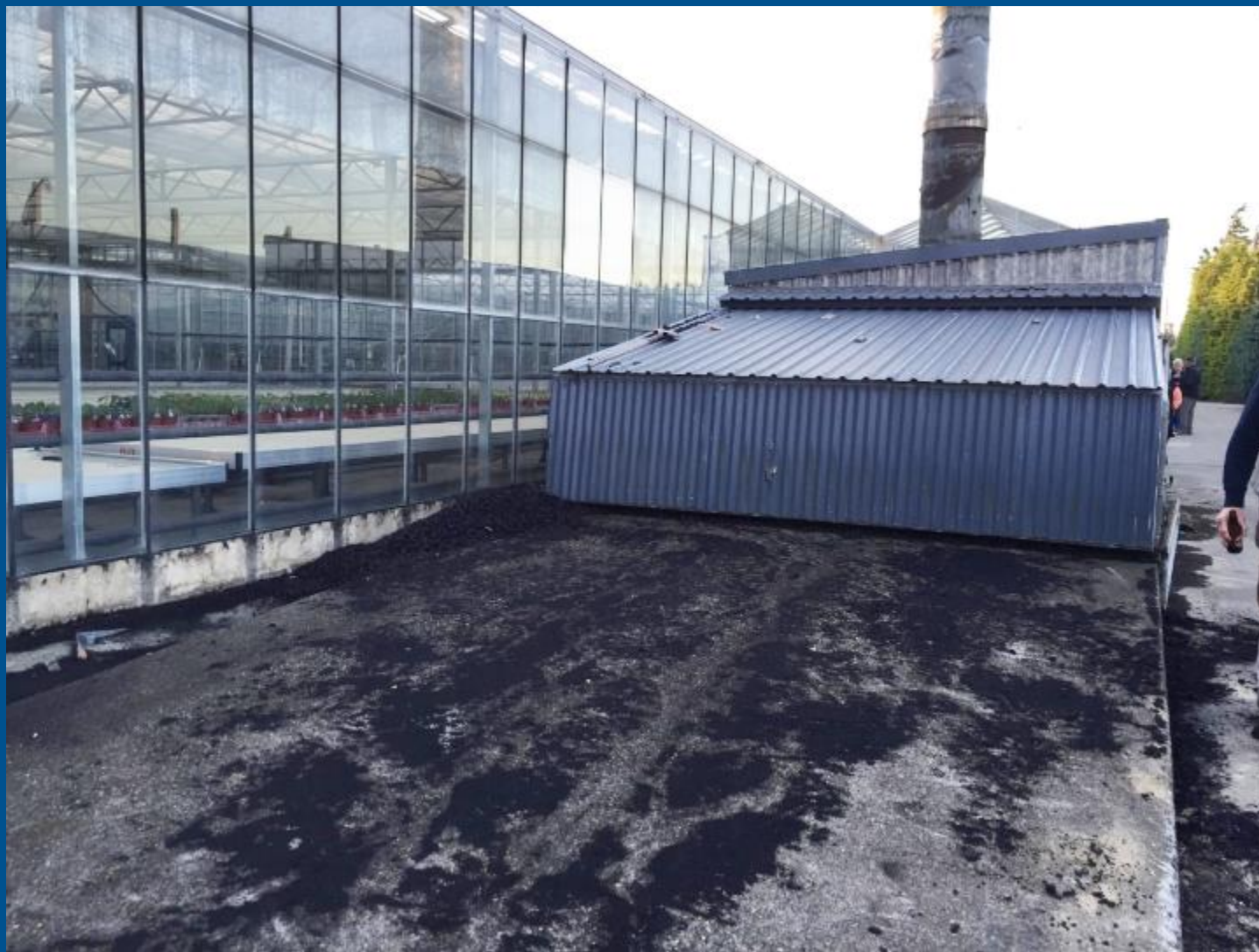
Coal fired boiler. Many places supplied their own heat this way.