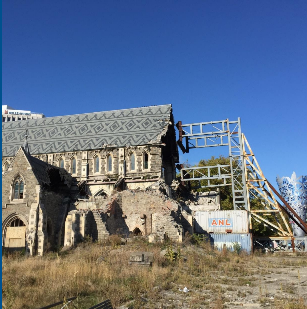
Earthquake damage to cathedral in Christchurch.