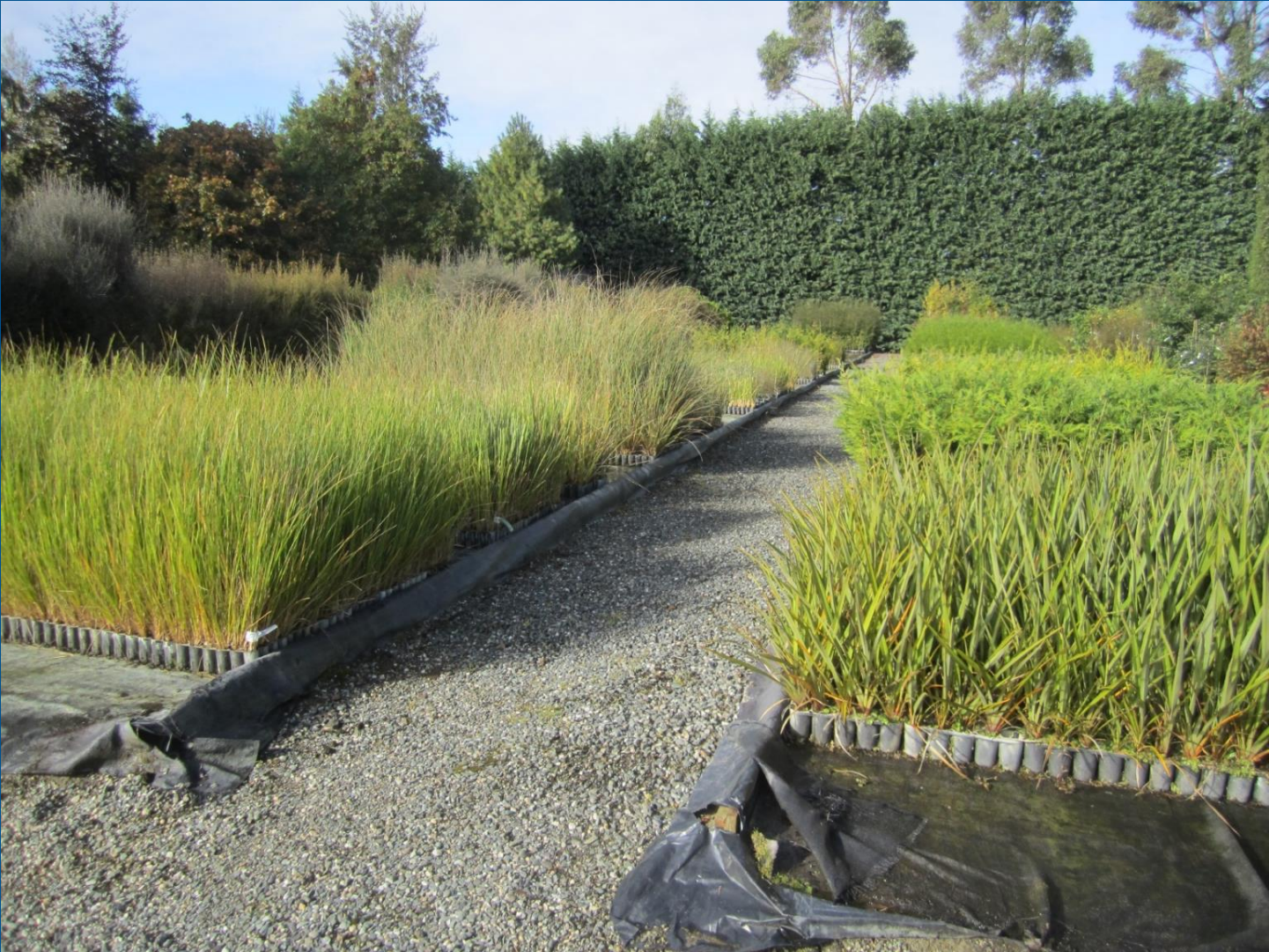
Interesting flood irrigation system