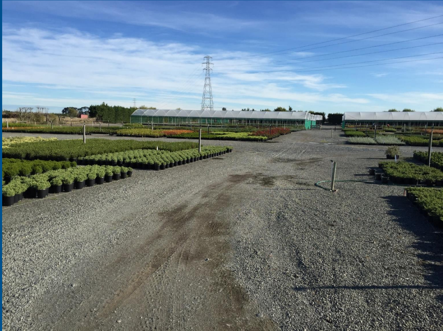
Ambrosia Nursery: Very clean operation