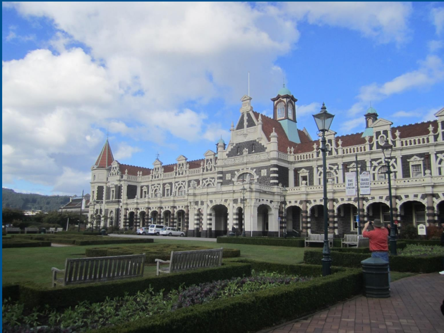
Dunedin Railway Station