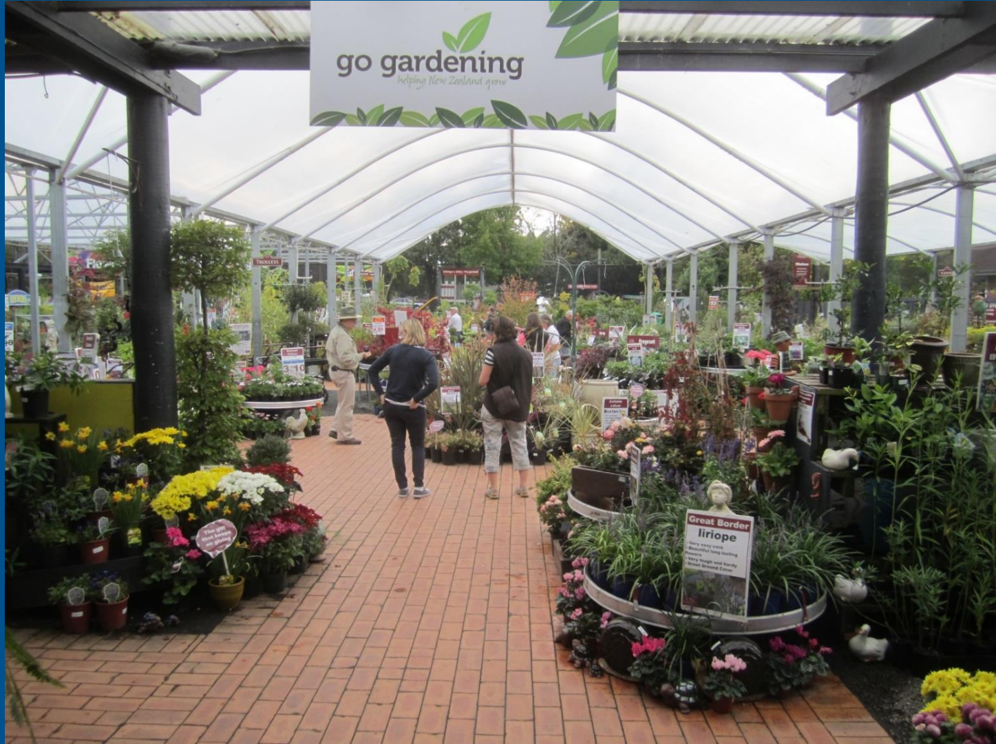
Lushington's Garden Centre – plant selection