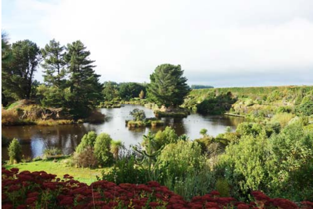
Lignite Pit Gardens, Invercargill (a reclaimed lignite pit)