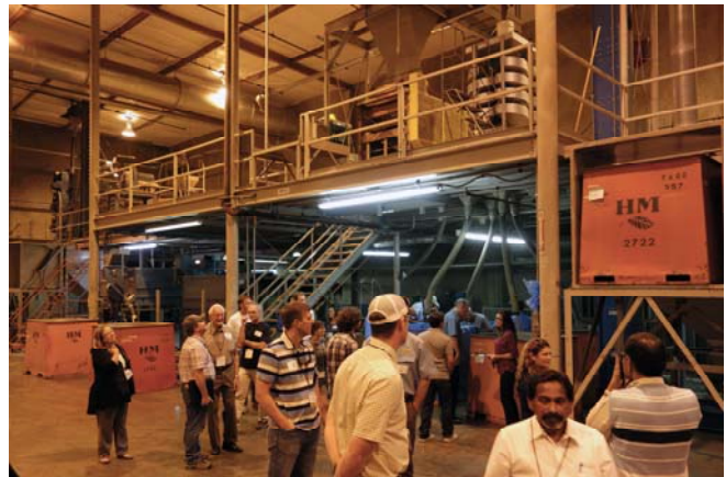
Seed processing facilities at the Harris Moran Seed Company, toured during the 2015 Annual Meeting in Modesto, California.