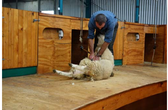
Sheep shearing at Roslyn Downs Partnership, Glencoe