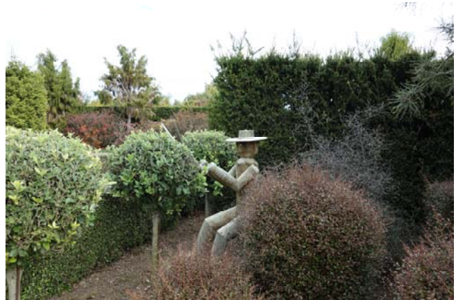
Busily pruning at Broadfield NZ Landscape Garden