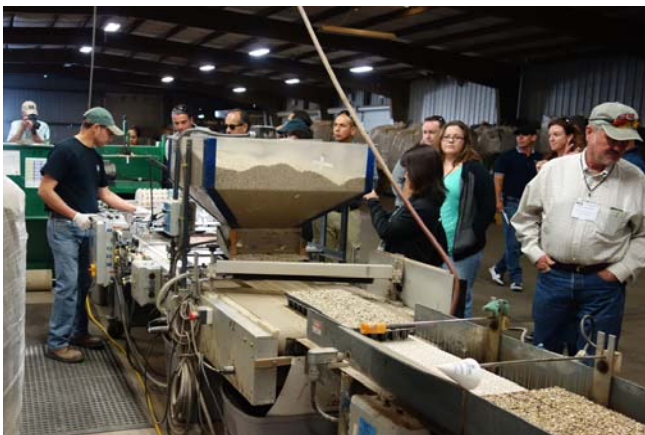
Seeding equipment viewed at Color Spot Nursery during the 2015 Annual Meeting in Modesto, California.

I look forward to seeing you in Phoenix, Arizona!