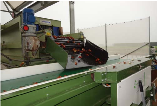
Washing tulip bulbs at Triflor NX Ltd., Invercargill