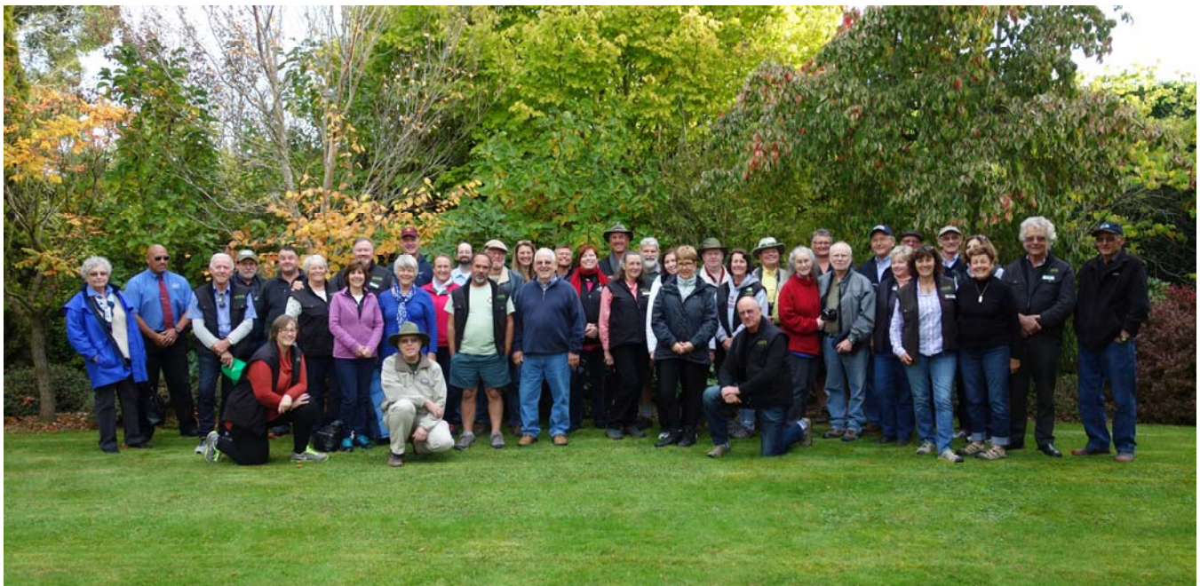
A fall afternoon in April with the IPPS International Board, other IPPS members, and hosts at the Hosta Gardens, Glencoe