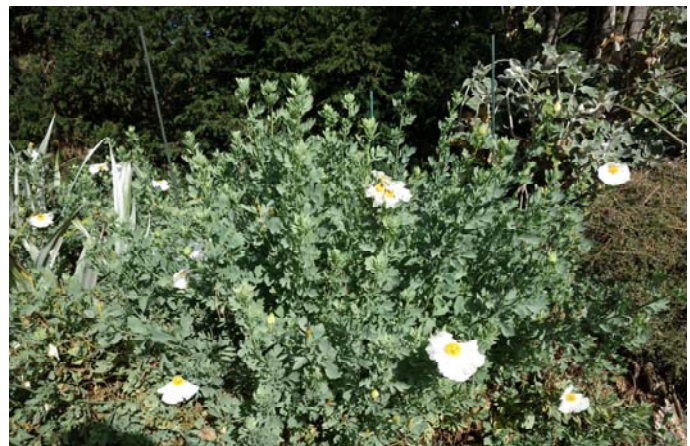
Larnach Castle (left), in Dunedin, New Zealand. California native Romneya coulteri (above) finds a home in the Larnach Castle gardens.