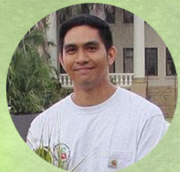
"Developing Propagation Protocols for Native Hawaiian Plants with Potential Landscape and Indoor Uses"