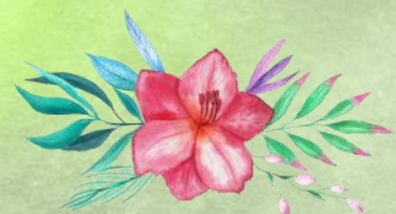
"The Propagation and Production of Ohi'a Lehua ( Metrosideros sp.) for Retail, Landscape, and Reforestation"