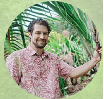
"Traditional and Contemporary Propagation of Hawaiian Crops"