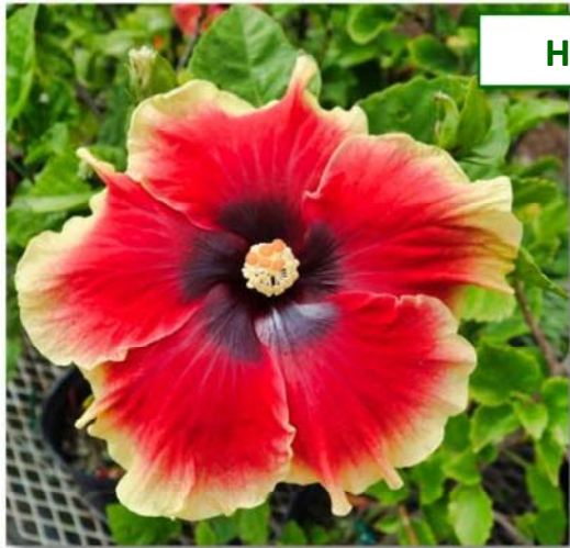
Hibiscus Lady Nursery