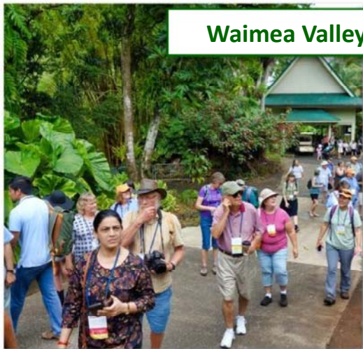
Waimea Valley Arboretum and Botanical Garden