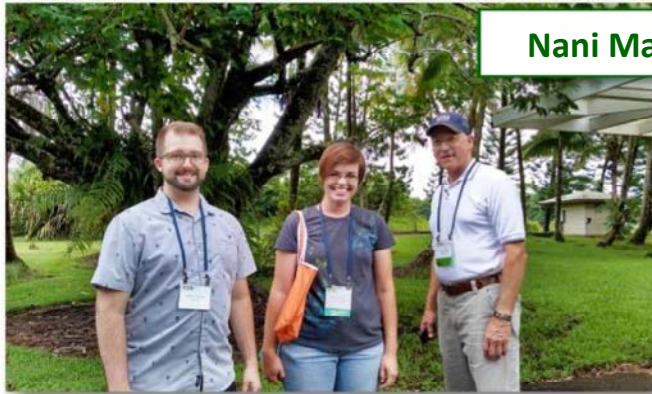
Nani Mau Gardens