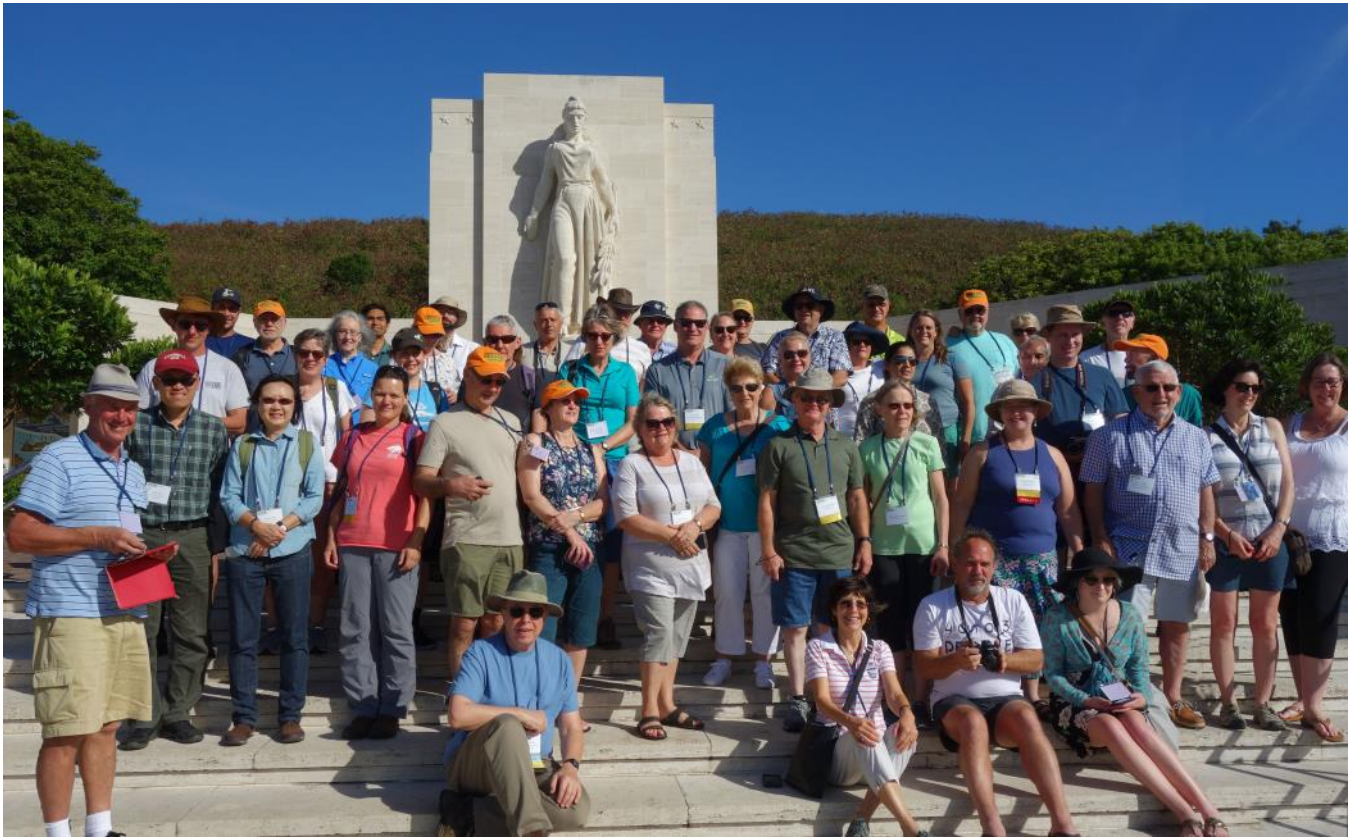
Pre-conference tour group at the National Memorial Cemetery of the Pacific in Honolulu.