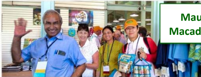
Mauna Loa Macadamia Nut