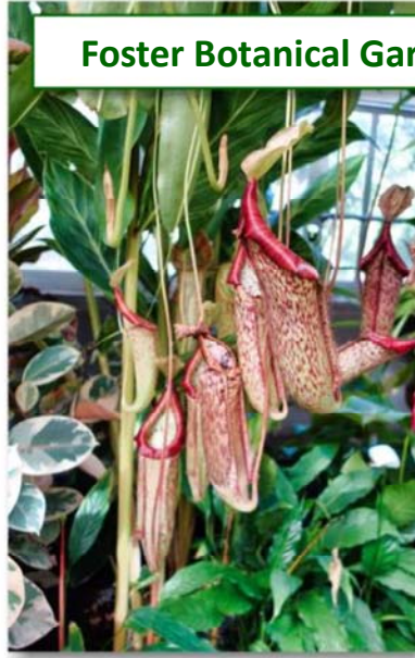
Foster Botanical Garden